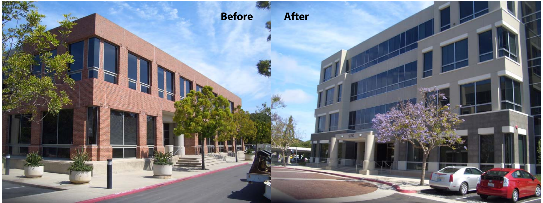
Highlands Corporate Center – Renovation Project – Del Mar, CA