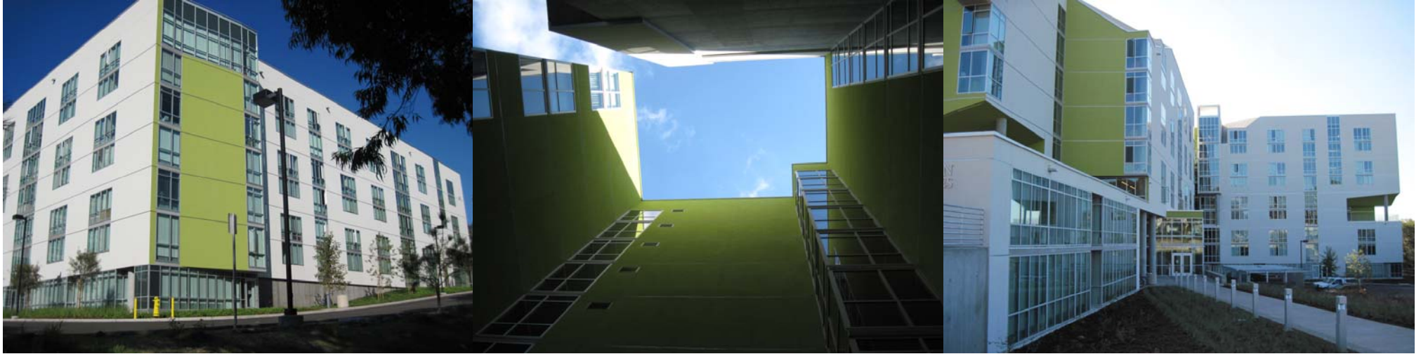
University of California, San Diego - Rita Atkinson Residences – La Jolla, CA